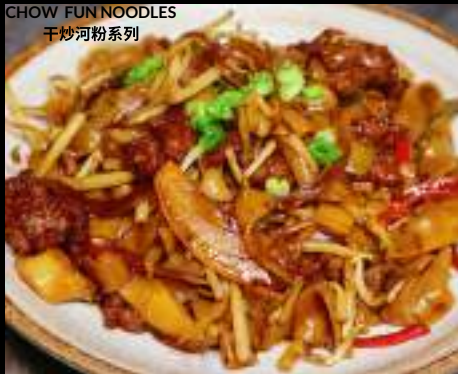
CHOW FUN NOODLES 干炒河粉系列