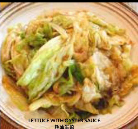
LETTUCE WITH OYSTER SAUCE 耗油生菜