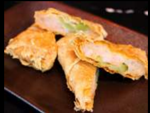
BEAN CURD SKIN ROLL WITH SHRIMP 鲜虾腐皮卷