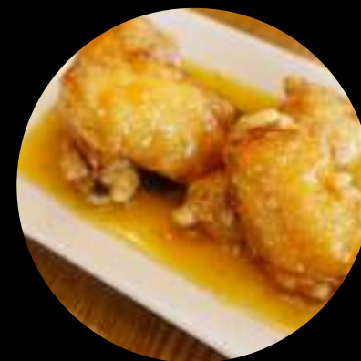
HONEY CITRUS WINGS 蜂蜜柚子鸡翅