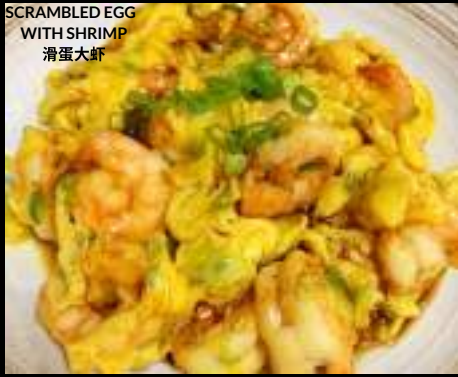
SCRAMBLED EGG WITH SHRIMP 滑蛋大虾