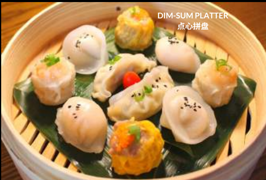
DIM-SUM PLATTER 点心拼盘