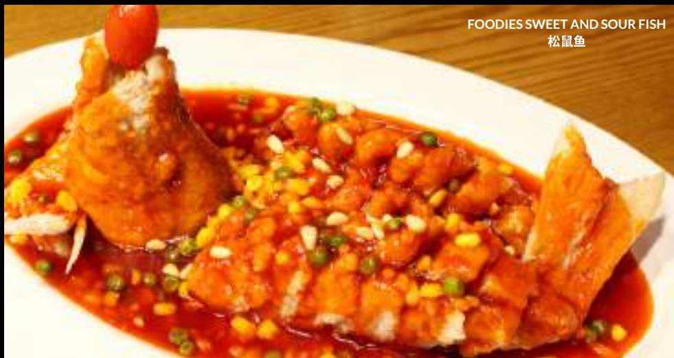
FOODIES SWEET AND SOUR FISH 松鼠鱼