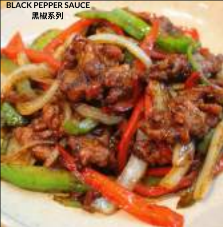
BLACK PEPPER SAUCE 黑椒系列

CHICKEN WITH BLACK PEPPER SAUCE 17.00 黑椒鸡片