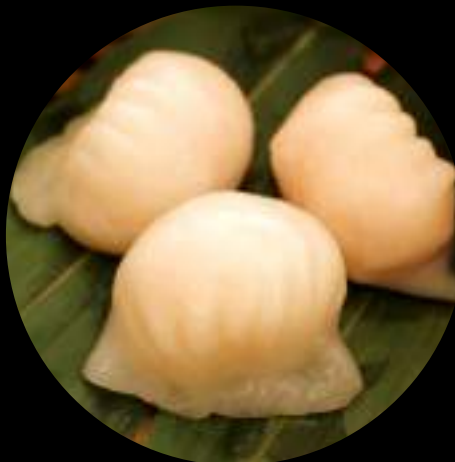
CRYSTAL SHRIMP DUMPLING 水晶虾饺