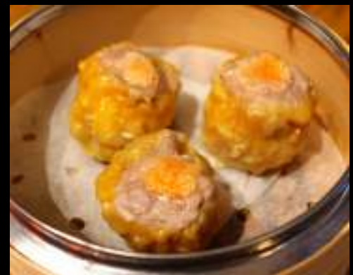
PORK SHUMAI WITH FISH EGG 鱼子烧麦皇