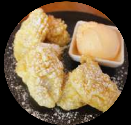
BANANA TEMPURA WITH ICE CREAM 香蕉天妇罗佐冰激凌 9.00