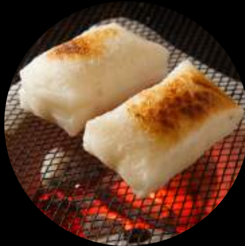
JAPANESE RICE CAKE 日式拉丝年糕 6.50