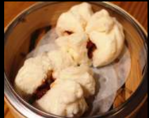
SWEET BBQ PORK BUN 港式叉烧包