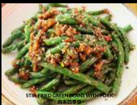
STIR-FRIED GREEN BEANS WITH PORK 肉末四季豆