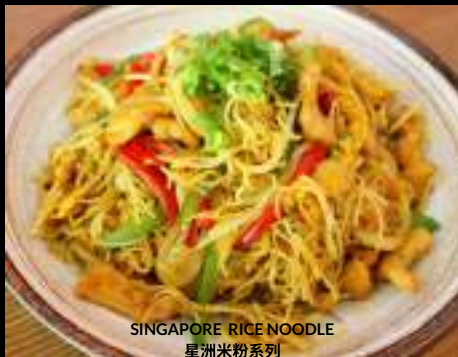
SINGAPORE RICE NOODLE 星洲米粉系列