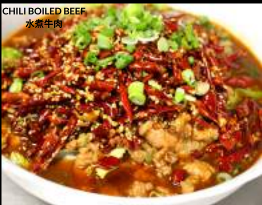
CHILI BOILED BEEF 水煮牛肉