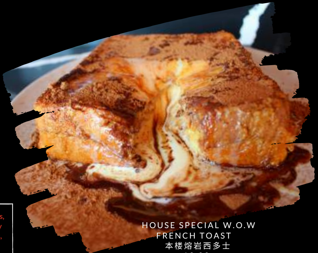
HOUSE SPECIAL W.O.W FRENCH TOAST 本楼熔岩西多士 13.00

*Consuming raw or undercooked meats, poultry, seafood, shellfish, or eggs may increase your risk of foodborne illness, especially if you have certain medical conditions.