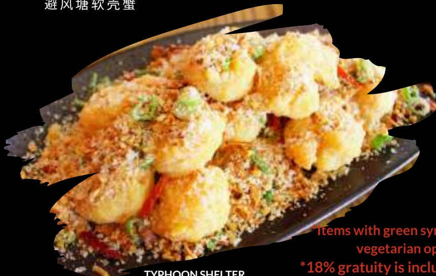
TYPHOON SHELTER 避风塘系列

TYPHOON SHELTER SOFT SHELL CRAB 23.00 避风塘软壳蟹