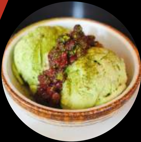
MATCHA ICE CREAM WITH RED BEAN 红豆抹茶冰激凌 6.50