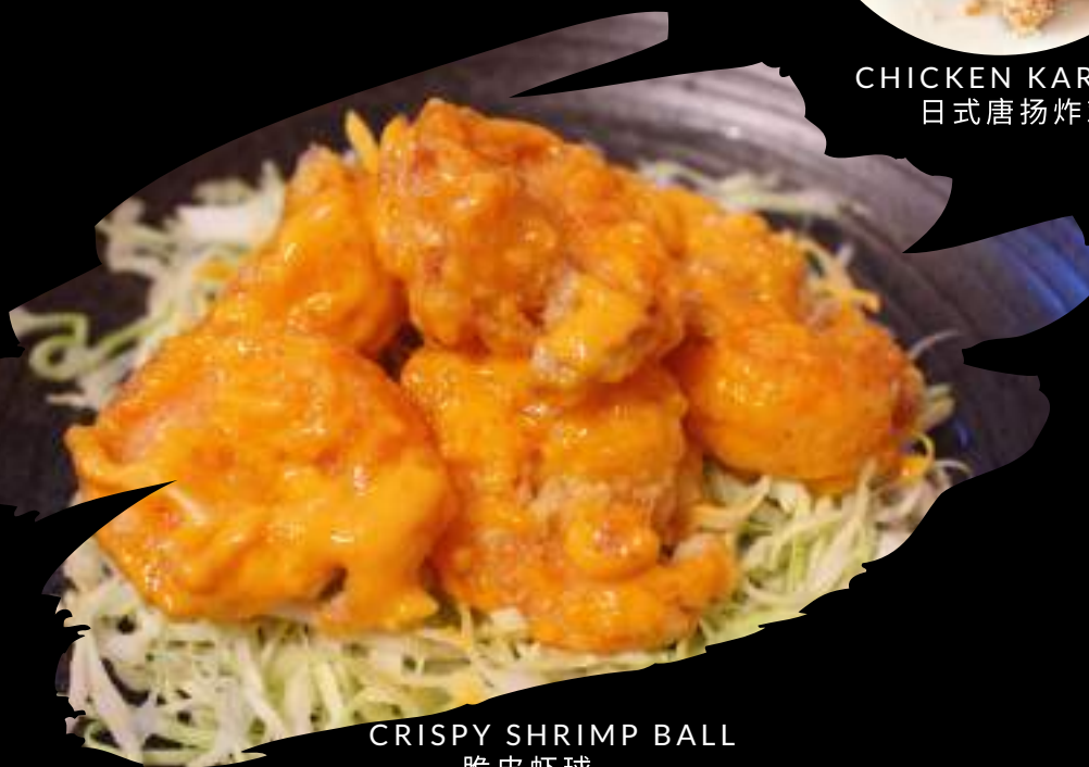
CRISPY SHRIMP BALL 脆皮虾球