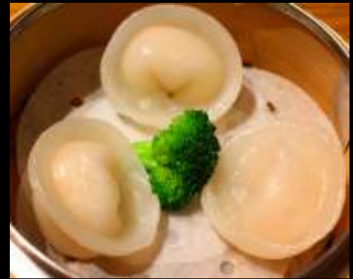
SCALLOP AND SHRIMP DUMPLING 鲜虾带子饺