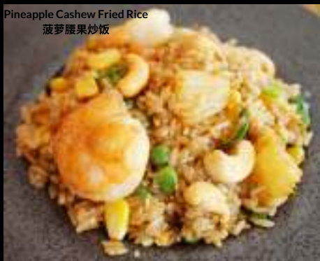
Pineapple Cashew Fried Rice 菠萝腰果炒饭