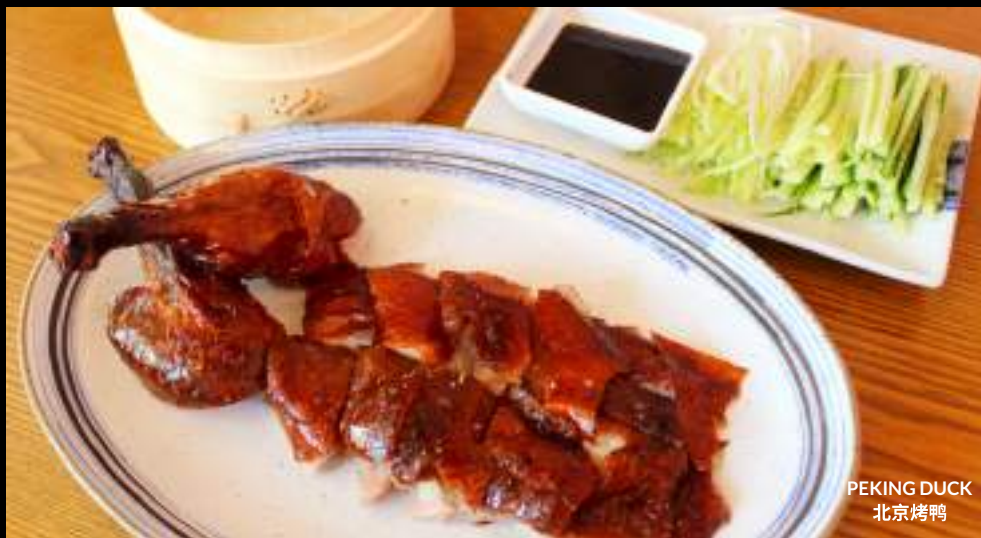
PEKING DUCK 北京烤鸭