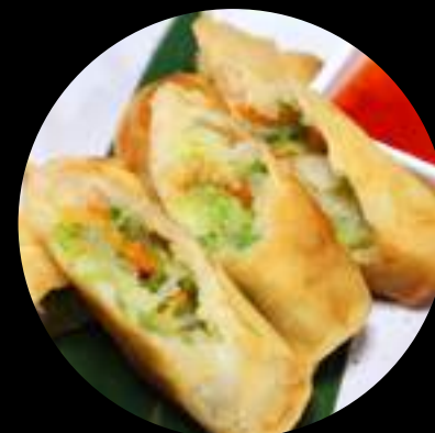
VEGETABLE SPRING ROLL 蔬菜春卷