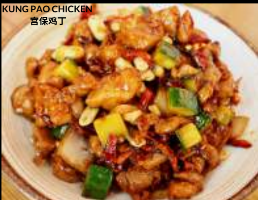
KUNG PAO CHICKEN 宫保鸡丁