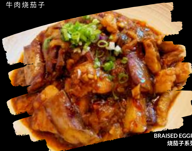
BRAISED EGGPLANT 烧茄子系列