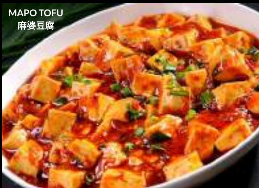
MAPO TOFU 麻婆豆腐