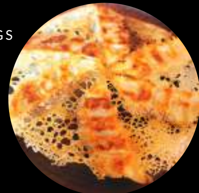
PAN FRIED GYOZA 冰花煎饺系列