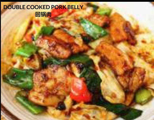
DOUBLE COOKED PORK BELLY 回锅肉