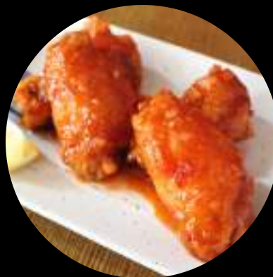
SWEET 'N SPICY WINGS 甜辣炸鸡翅