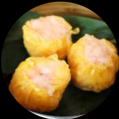
SHRIMP SHUMAI 虾烧麦