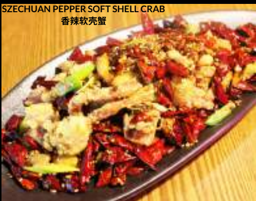
SZECHUAN PEPPER SOFT SHELL CRAB 香辣软壳蟹