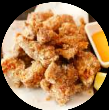
CHICKEN KARAAGE 日式唐扬炸鸡