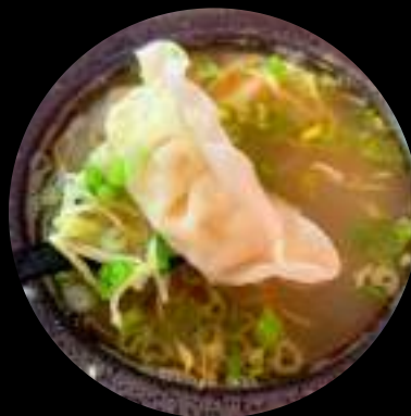
DUMPLING SOUP 本楼饺子汤